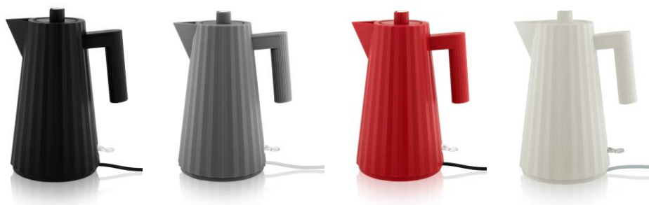
Plissé HK$ 1,220

Characterized by its folds, the Plissé kettle was created by one of the leading figures in architecture and contemporary design, Michele De Lucchi. It was shaped starting from a folded sheet of paper, then developed and produced by Alessi as if it were a beautiful sartorial object.