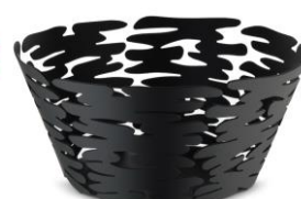
Barket in Black, Red and White HK$ 475 (Small) HK$ 550 (Large)

Inspired by the "Bark" series, Barket is a virtuous example of the technical ability Alessi has achieved in the processing of cold-pressed materials. Work of the interior design architects couple Michel Boucquillon and Donia Maaoui, the eye-catching basket features a perforated surface that can be placed on your table with fruit and decorative orbs for a voguish centerpiece. Available in four versions: polished steel, and colored steel in white, black or red.