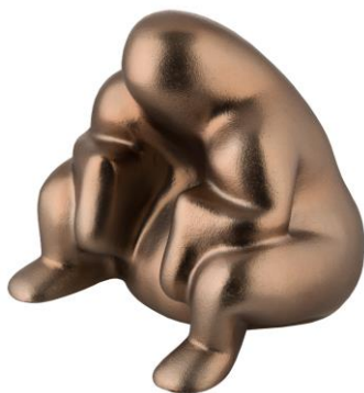
Dédé Door Stop Pink HK$ 625 Black HK$ 625 Brown Metal HK$ 1,240

To celebrate 30 years since the inception of the famed Girotondo collection by the King-Kong duo Stefano Giovannoni and Guido Venturini, Alessi has launched a special, limited edition collection in 24 carat gold plating. The new series is limited to 999 pieces, and features The Basket, the Fruit Bowl and the Round Tray.