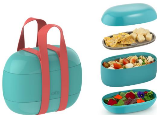
Food à porter in Light Blue HK$ 615

Unveiling the new Moka Espresso Coffee Maker , British architect David Chipperfield pays homage to the original Moka first created in the 1930s by Alfonso Bialetti. Featuring two extra sides and a new flat lid, the new edition allows optimum enjoyment of the aroma and flavour of the drink.