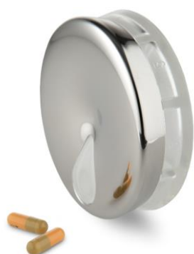
YoYo Silver HK$ 365 Golden Pink HK$ 440

Featuring a grain texture that follows the geometric Fibonacci sequence, and a clean matte finish, the Round Basket perfectly sets a modern minimalist table. Designed by Jasper Morrison, the tray has a style reminiscent of hand-crafted pieces of pottery with a contemporary twist.