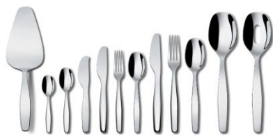
Itsumo 5-piece Set HK$ 285 24-piece Set HK$ 1,115

To ensure a pleasant grip, the Asian master of minimalism, Naoto Fukasawa, conceived the Itsumo , meaning “daily and forever” in Japanese. The sturdy steel utensil set will bring subtle style to the table and add a touch of sparkle to any occasion.