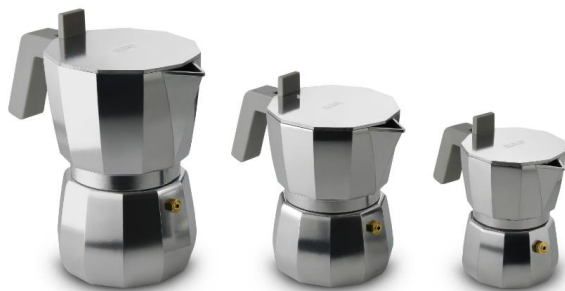
Moka, Espresso Coffee Maker 6C HK$ 525 (Left) 3C HK$ 425 (Middle) 1C HK$ 350 (Right)

(Hong Kong – 22 May 2019) – This Spring, Alessi, the Italian design factory, celebrates design as a driving force of culture with elements of bold transgression revealed in its new, modernistic collection.