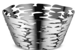
Barket in Stainless Steel HK$ 725 (Small) HK$ 900 (Large)

Made of thermoplastic resin, the new edition is a fresh take on the "solitary and plump" anthropomorphic features that have been ascended to make for a dominant presence in today's contemporary living spaces.