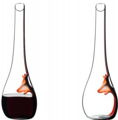
The Dog Decanter HK$4,500

Only 20pcs of each decanter are available for sale in Hong Kong with just 500 of each color produced for sale globally.