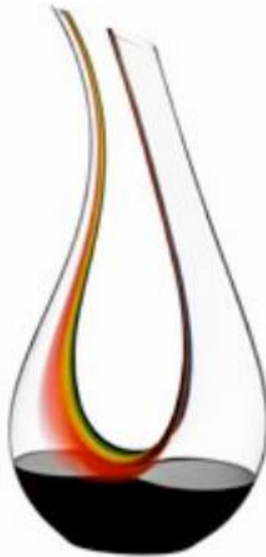
The Amadeo Double Magnum Rainbow HK$25,000