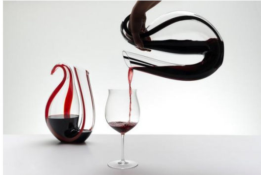
Ayam Magnum Decanter HK$5,980

Launched a year ago, Ayam has returned with a new face and size. The ornate colors; red and black, which gratifies a penchant for an artistic flair have been introduced in a magnum size and as limited-edition pieces. Aside from the irresistible beauty of its design, the double decanting function which aerates wine when it is poured into and from the decanter, significantly shortens the aeration time and opens up young wines to show their full potential. As the wine enters and exits the decanter, a mellifluous gurgling sound is produced – a palpable indication of Ayam's potent oxygenation process. It is no surprise the Ayam Decanter was selected as the winner of the 'Good Design Award'.