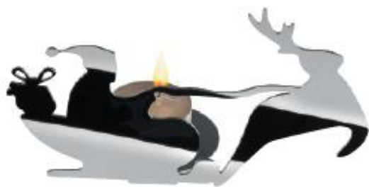
Barksled Christmas Ornament HK$350