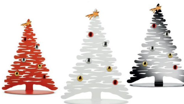
Bark for Christmas Christmas Ornament HK$1,590 HK$1,149 (Red, White)