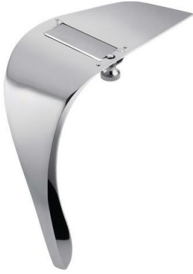
Alba Truffle Slicer HK$875

Developed over a two-year period, which involved the participation of 15 designers, the National Centre for Truffle Studies and the International White Truffle Fair of Alba combined their expertise to bring together the uniqueness of a local product with the most advanced design technology. “Alba” was inspired by intertwining tree roots and the knottiness of tubers. Extensive consideration was given to finding the best ergonomic position and balance of weight when the slicer is held in the hand. To enable better ergonomic slicing and reduce pressure on the wrist, there is an 18-degree angle between the handle and the blade. This combination of parameters enabled a sculptural form with a practical use.