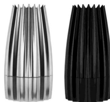
Salt, pepper and spice grinder Grind HK$875 HK$1,040 (Black)

The “Grind” salt, pepper and spice mill project, designed by William Alsop and Federico Grazzini , offers a new aesthetic and a new way of using this product. Made from cast aluminium, the mechanism remains visible, making it possible to put the spice mill down on the table without ground spice residues scattering everywhere.